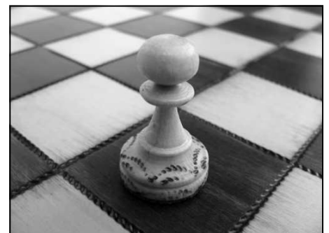
KIDS CHESS CLUB— Wednesdays in January

For more information about these and other programs please see Meg Clancy, Youth Services Librarian or check the Youth Room bulletin board on the ramp for the current month's activities too!