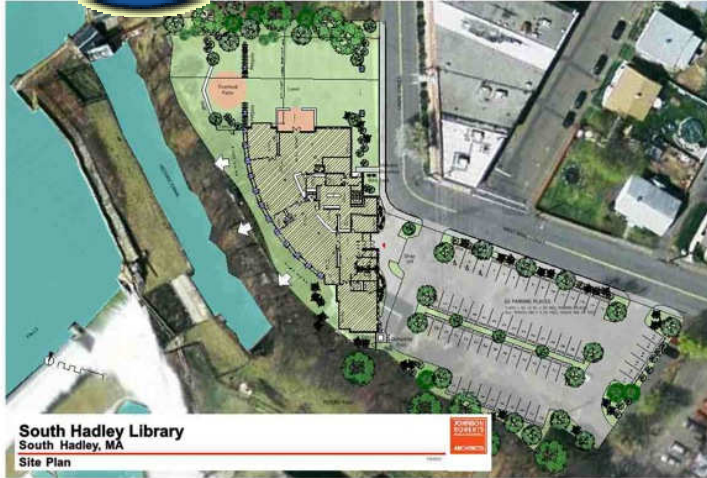
South Hadley Library South Hadley, MA Site Plan

South Hadley Public Library News—May 2011